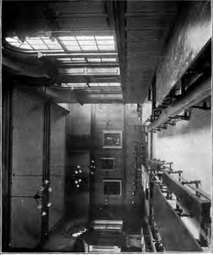
From a photograph by the